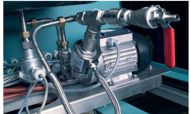
All steam or feed water pipes and components are made of stainless steel.

Unotherm electric steam generator needs no additional fresh water connection for the cooling of the desalination water. A heat recovery system allows this energy to be used for warming up feed water.