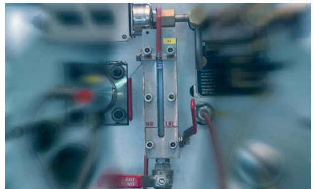
Illuminated water gauge

If used in combination with a Selectomat PL, the Unotherm will automatically warm up the MMM sterilizer.